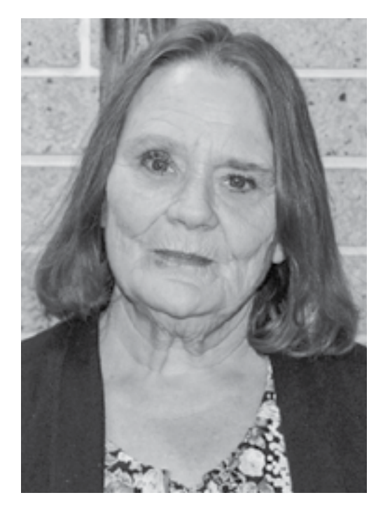
God in the face."

When I was released, I came straight to Reno-Sparks Gospel Mission, where a big part of my year-long program is getting right with God. Before, I felt like I was slapping God in the face. That was an awful feeling. But now I know God is with me every step. I've never felt His presence so strong